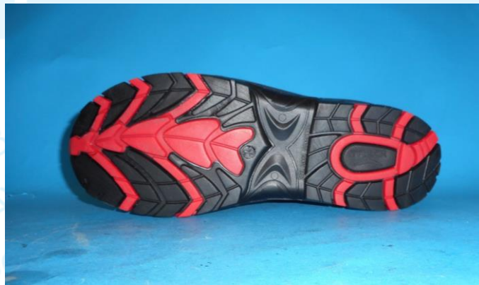
Sole design for styles Nitro 655 Pull Up, Nitro 525 Pull Up and Nitro 835