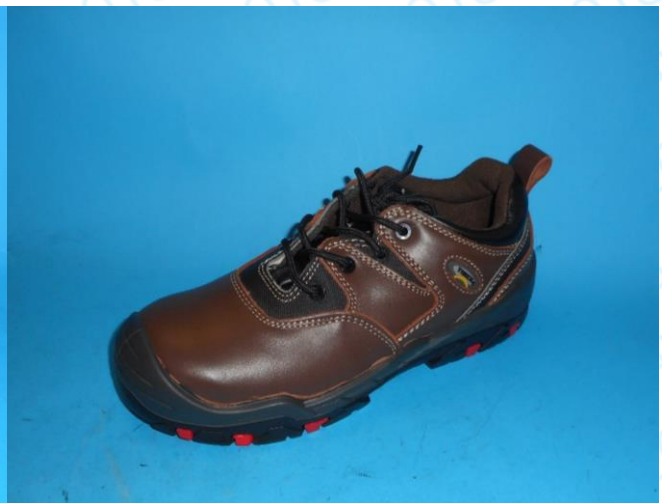
Nitro 655 Pull Up and Nitro 525 Pull Up