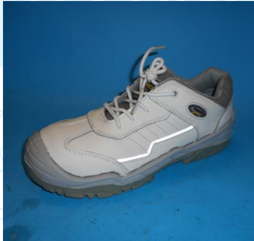
Guardian 960 (white variant)