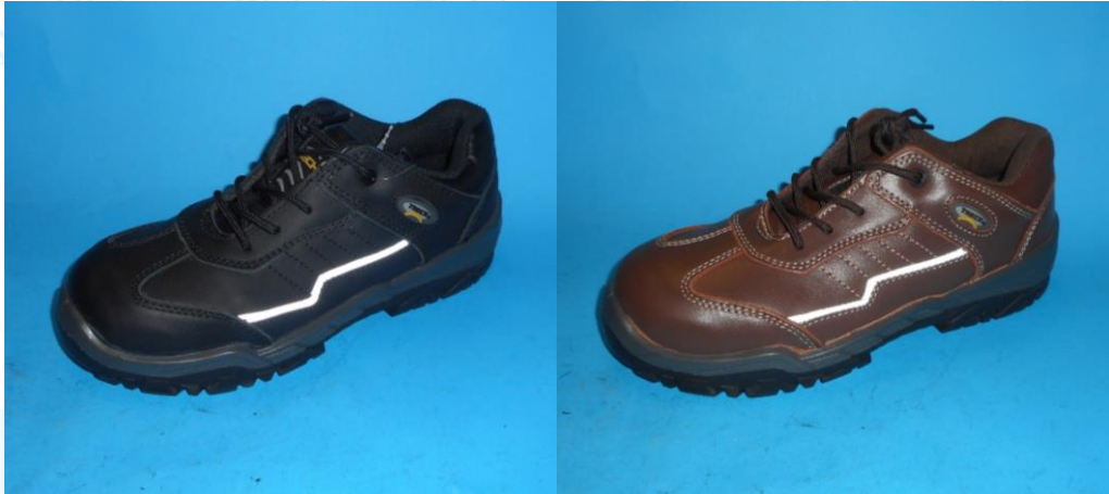
Guardian 960 (black and brown variants)