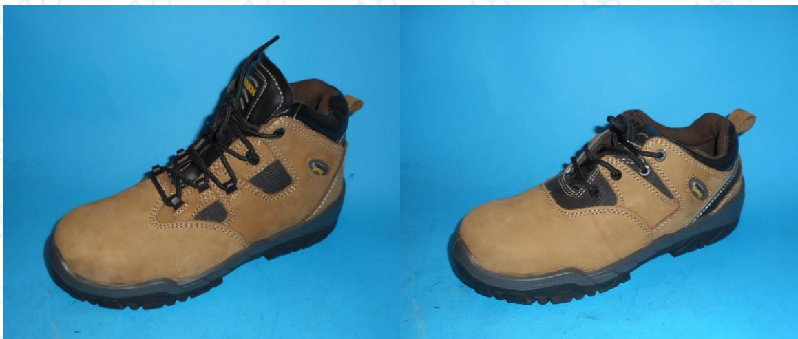
Nitro 655 Nubuck and Nitro 525 Nubuck