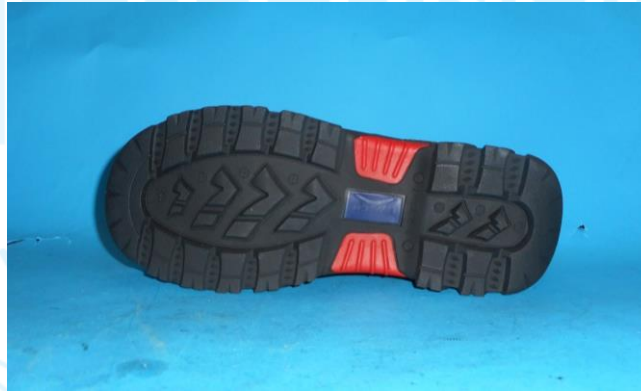
Sole design for styles SF 975 and KX 562