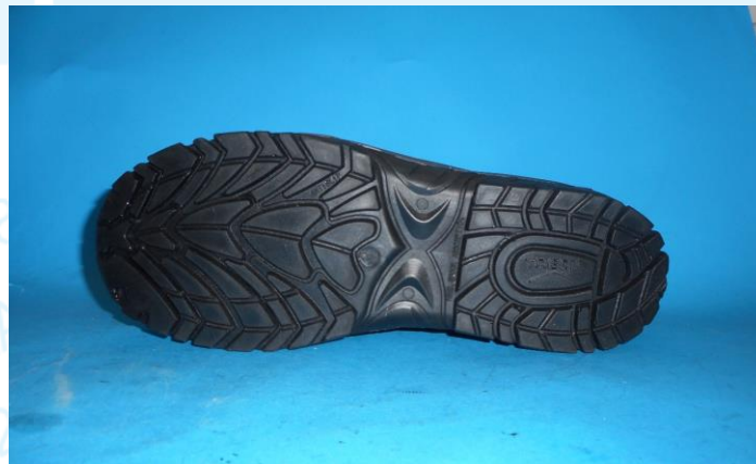
Sole design for styles Nitro 655 NB, Nitro 525 NB, Guardian 960, DCS 954 and MK 548