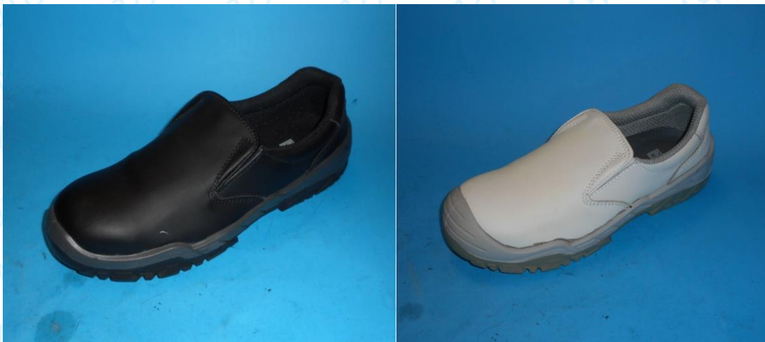
DCS 954 (black and white variants)