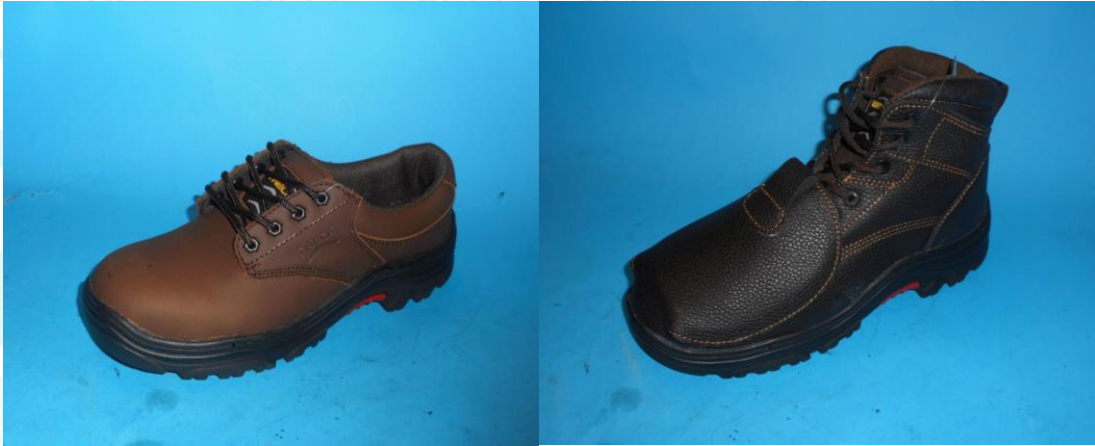
SF975 (left) and KX562 (right)