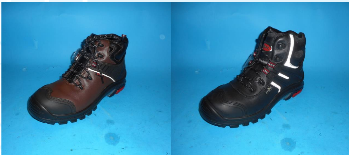
Samples described as V90 (left) and V100 (right)