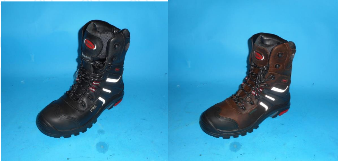
Samples described as V200 (left) and V600 (right)