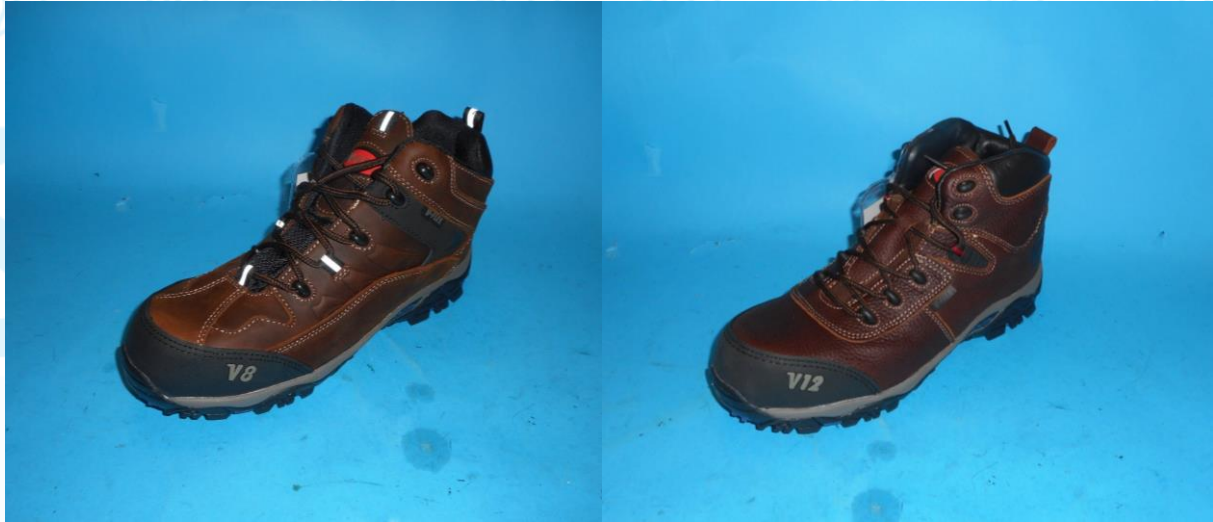
Samples described as V8 (left) and V12 (right)