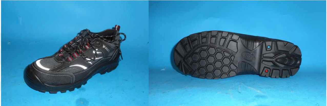
Styles V75 (left) and sole design for styles V40, V45, V66 and V75 (right)