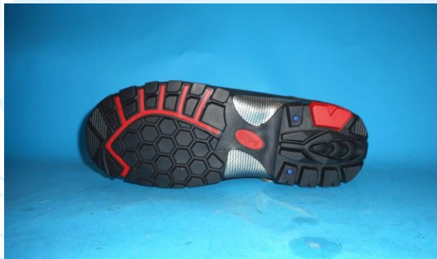
Sole pattern for styles V32, V50, V90, V100, V200 and V600