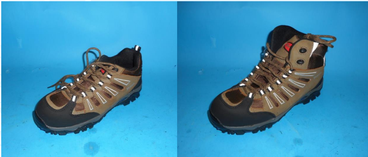
Samples described as V31 (left) and V35 (right)