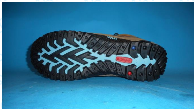
Sole design for styles V1 and V2