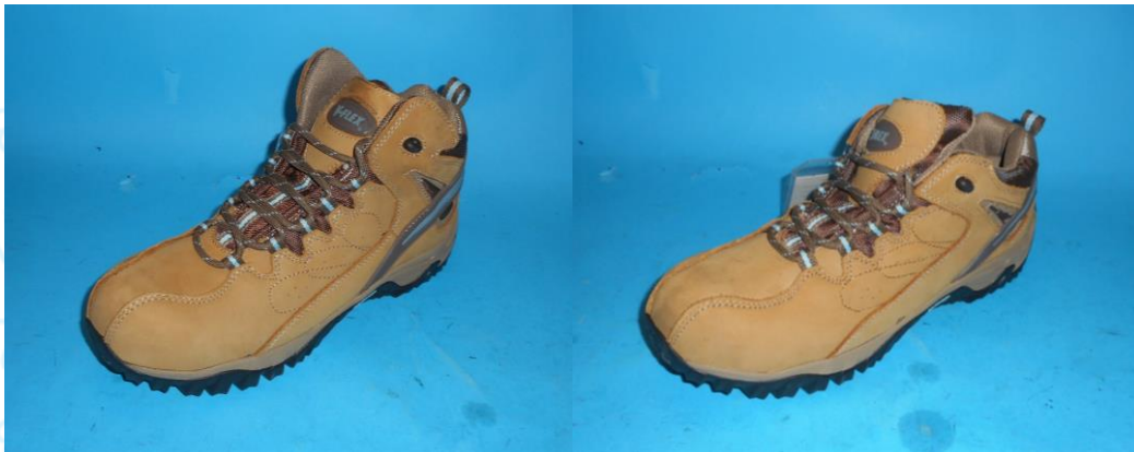
Samples described as V1 (left) and V2 (right)

Rubber outsole (V1, V2, V32, V50, V90, V100, V200, V600, V40, V66, V75) Dual density PU (V8, V12, V31, V35) Elite Dongguan