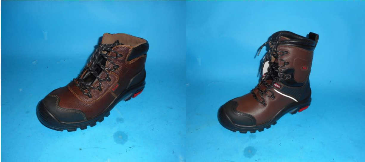
Samples described as V32 (left) and V50 (right)