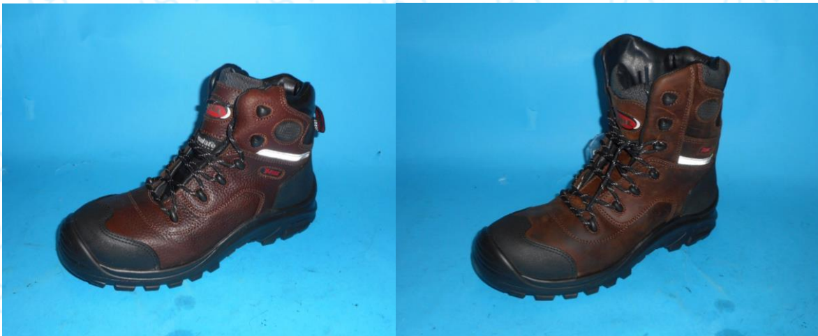
Styles V40 (left) and V66 (right)