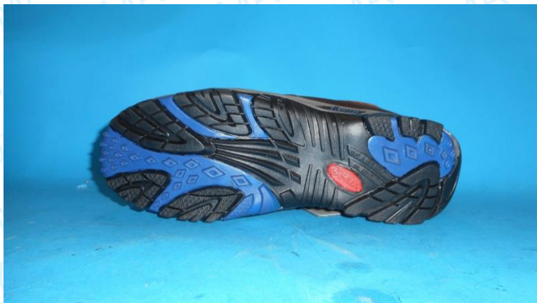
Sole pattern for styles V8, V12, V31 and V35