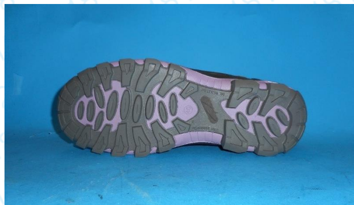
Sole pattern used on all styles (V3 shown)