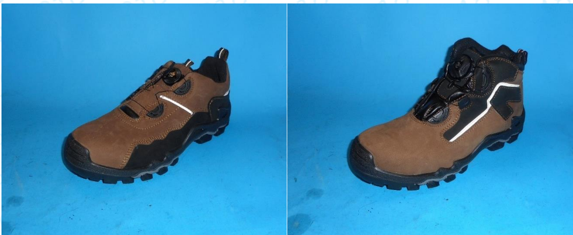
Style V7 (left) and V10 (right)