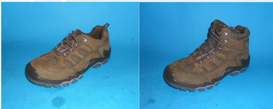
Style V3 (left) and V5 (right)