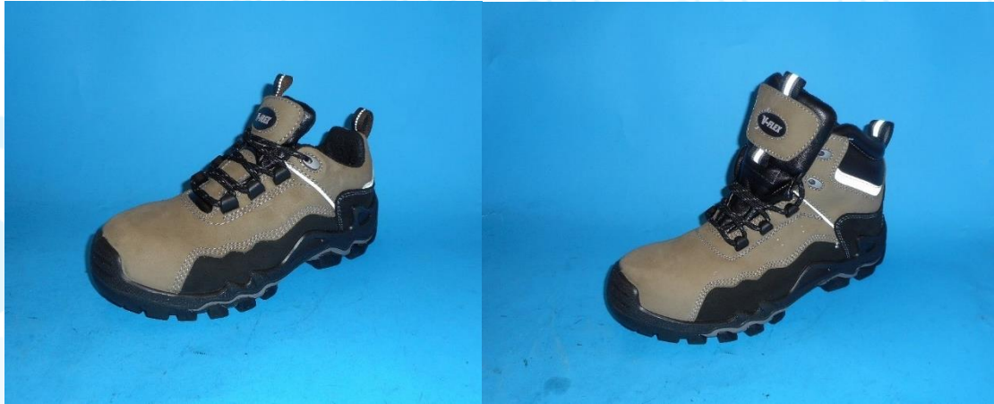
Style V11 (left) and V17 (right)