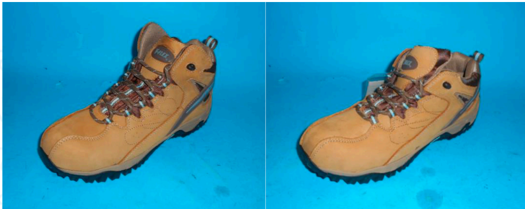
Samples described as V1 (left) and V2 (right)