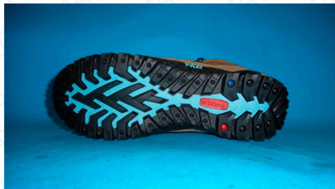
Sole design for styles V1 and V2